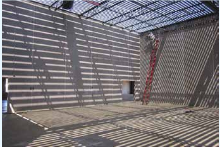
Construction crews are busily erecting a new 37,000-square-foot permanent school building for Imagine Andrews.