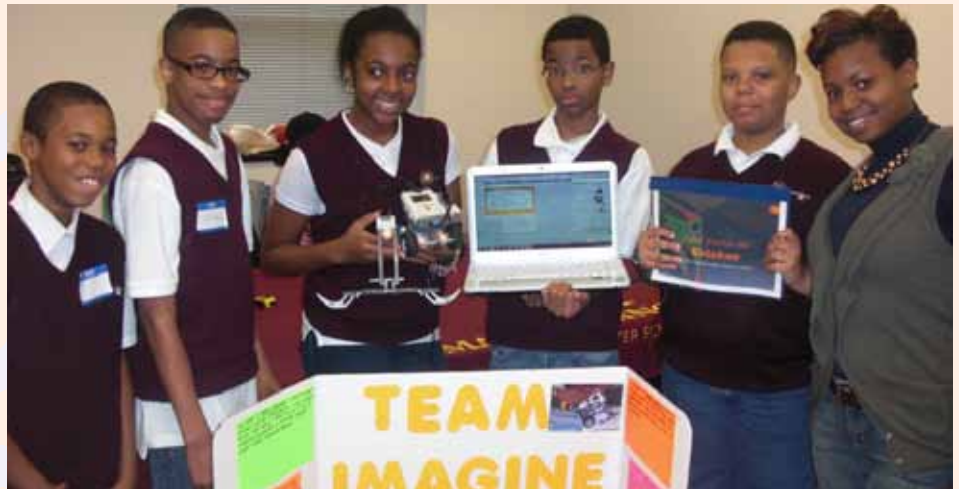
Members of Team Imagine Lincoln demonstrate why they were awarded "Best Presentation."