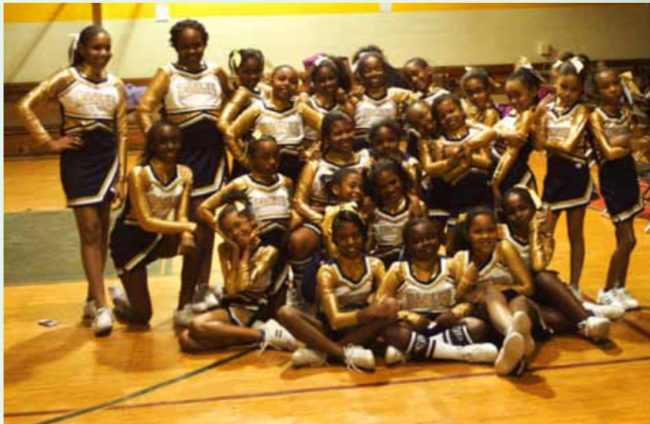
The Lady Eagles Cheerleaders pose before the big game.

On January 12, it was Imagine v. Imagine under the backboards as the Foundations girls basketball team (the Lady Eagles) hosted the Lincoln girls team (the Lady Lynx) for the first time. The teams were made up of students in Grades 6-8. The score may soon be forgotten (although — ahem! — Lincoln won), but the memories made playing this historic game will be cherished forever. Way to go, girls!